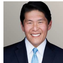
Rob Hur Partner +1 202 383 8969 rhur@kslaw.com

Provides executives guidance in preparing for their testimony by leveraging her invaluable experience testifying before Congress on critical matters.