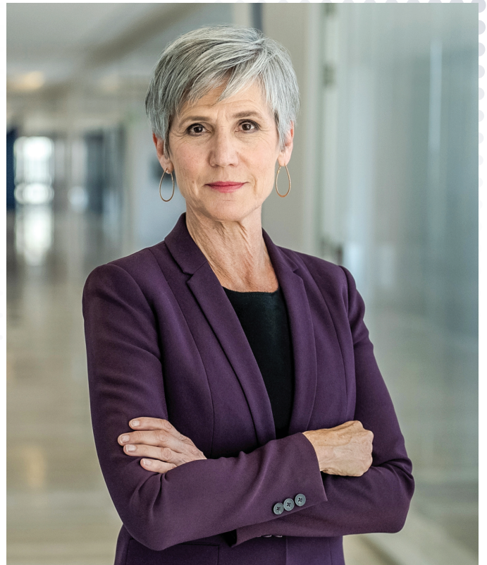
The 15-lawyer team "gave every single ounce of themselves" to get the report done and done right. — Sally Yates

It was clear from the opening sentences that a 2022 report produced from a yearlong investigation Sally Yates led into sexual abuse in U.S. women's pro soccer would pull no punches.