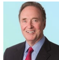
Dan Lungren San Francisco/ Washington, D.C. +1 415 318 1233 +1 1 202 626 9120 dlungren@kslaw.com