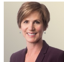
Sally Yates Atlanta/ Washington, D.C. +1 404 572 2723 +1 202 626 2937 syates@kslaw.com