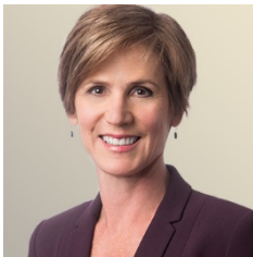
Sally Yates Washington, D.C., Atlanta +1 404 572 2723 syates@kslaw.com