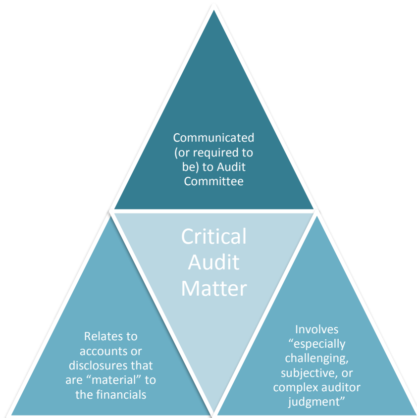
Figure 1. Critical Audit Matter Test

committee. i Second , the CAM must relate to accounts or disclosures that are “material” to the Company’s financial statements. Note, however, that the CAM itself need not be material, it is only required that the account or disclosure to which the CAM relates be material. Third , the CAM involves “especially challenging, subjective, or complex auditor judgment.”